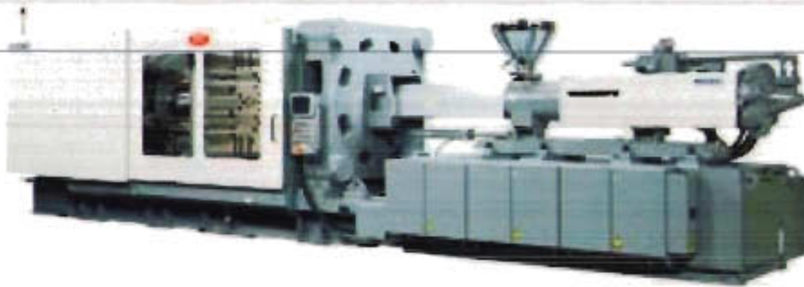
1450 Ton Injection Molding Machine